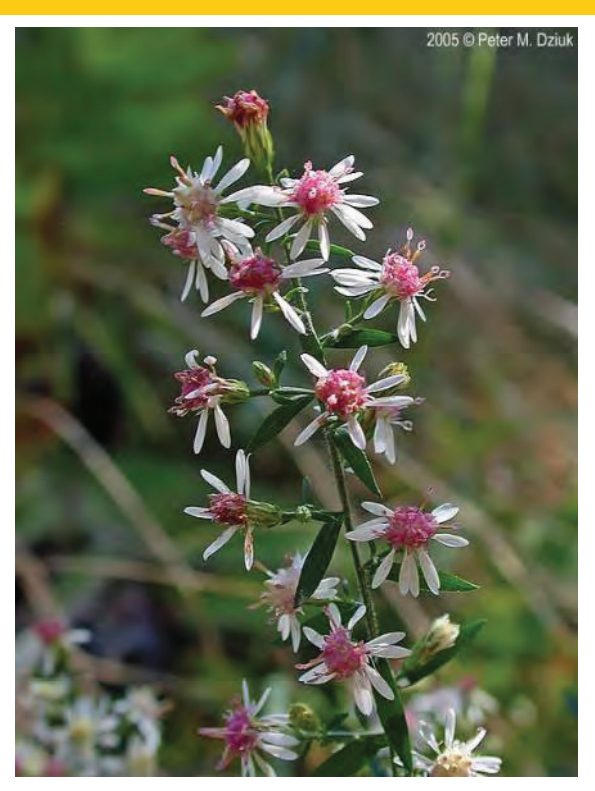
Full flowering/close-up of blooms