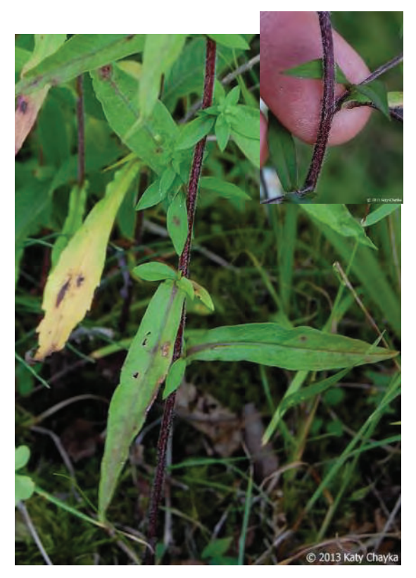
Stem and leaf arrangement