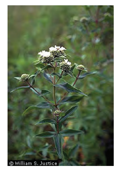
Stem and leaf