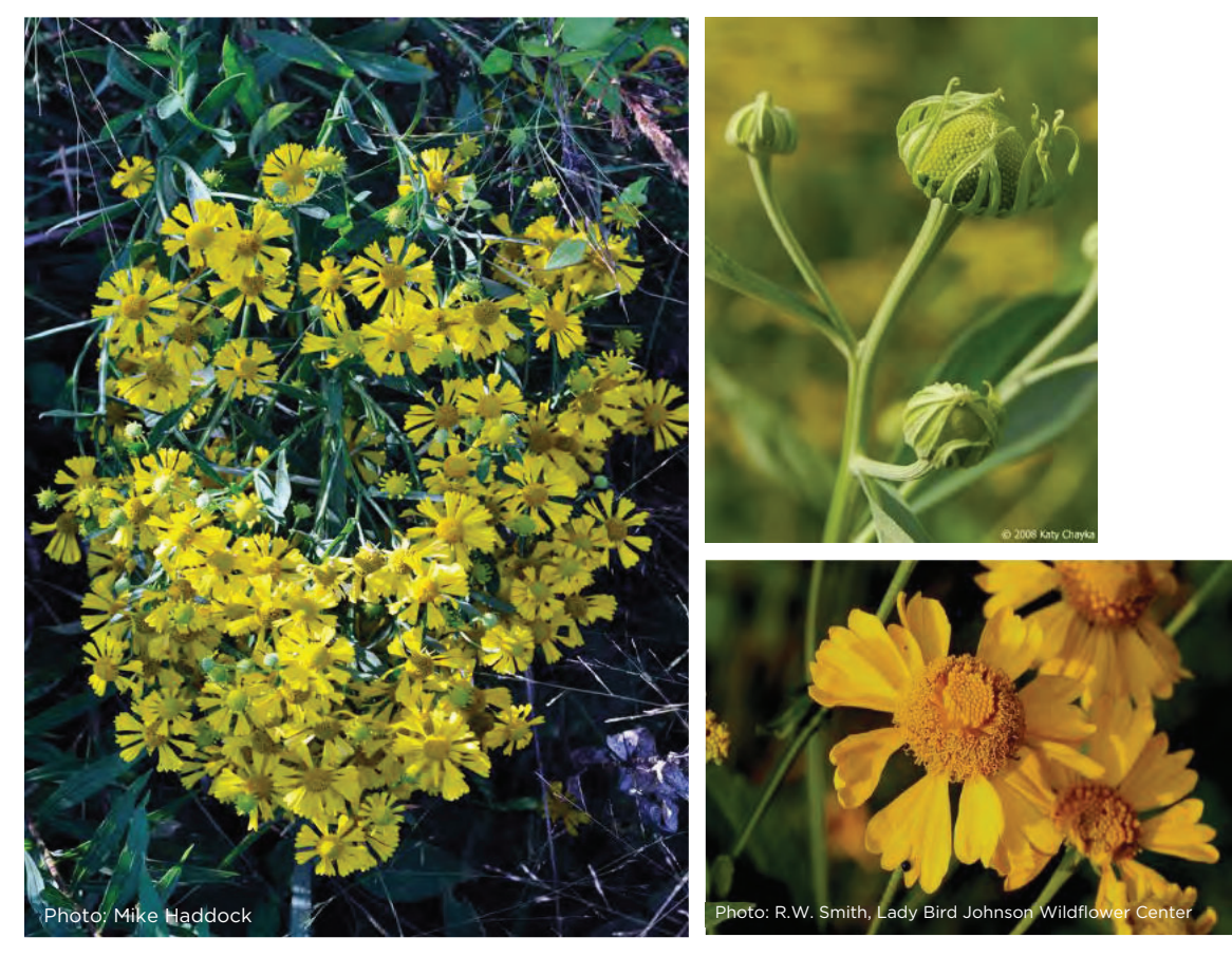
Flowering/close-up of flowers/bud