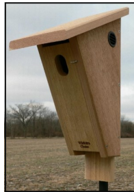
Slanted Bluebird Nest Box with Vents