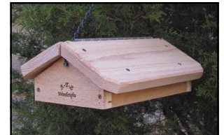
Upside Down Suet Feeder (Hanging)