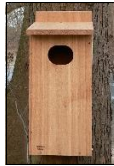
Wood Duck Nest Box