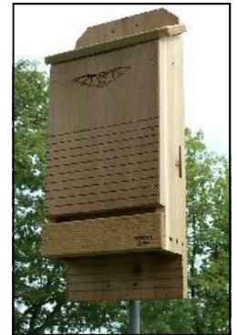
Three Chamber Bat Box