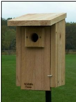
Bluebird Nest Box