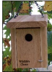
Wren Nest Box (Hanging)