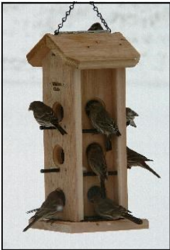
Thistle Bird Feeder