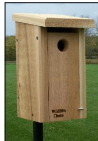
Wren Nest Box (Mounting)