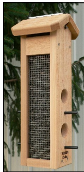
Sunflower Bird Feeder