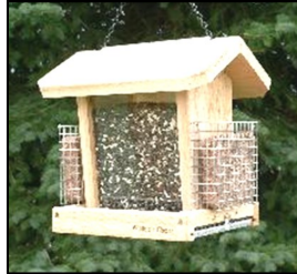
Hanging Bird Feeder with Two Stainless Steel Suet Holders