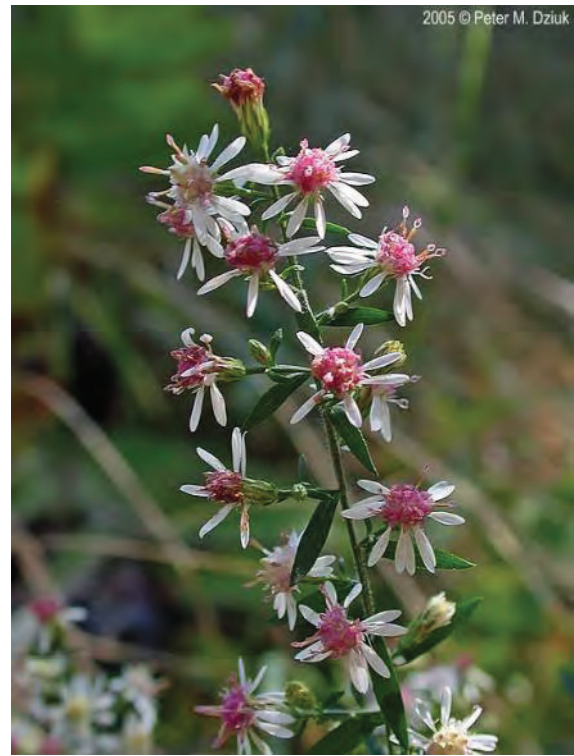
Full flowering/close-up of blooms