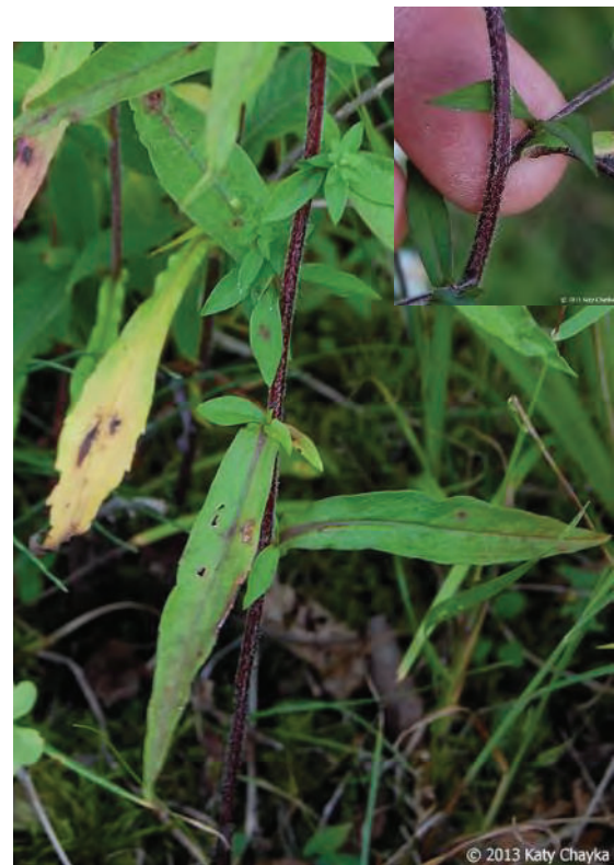
Stem and leaf arrangement