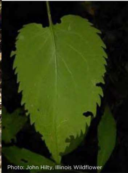
Close-up vegetative growth and leaf