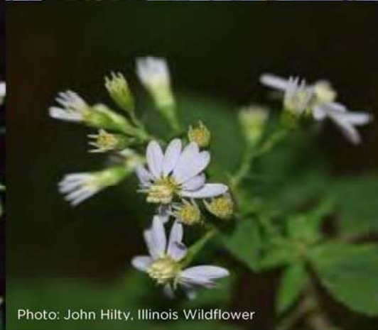
Full flowering/close-up of blooms