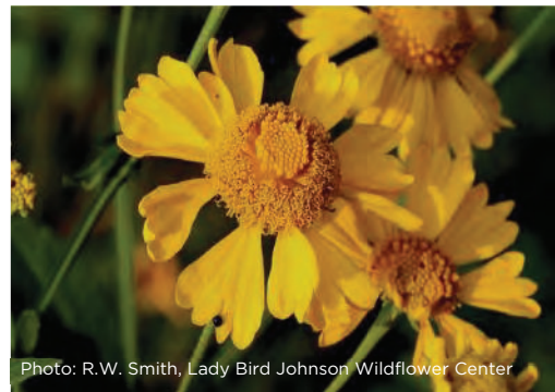
Flowering/close-up of flowers/bud