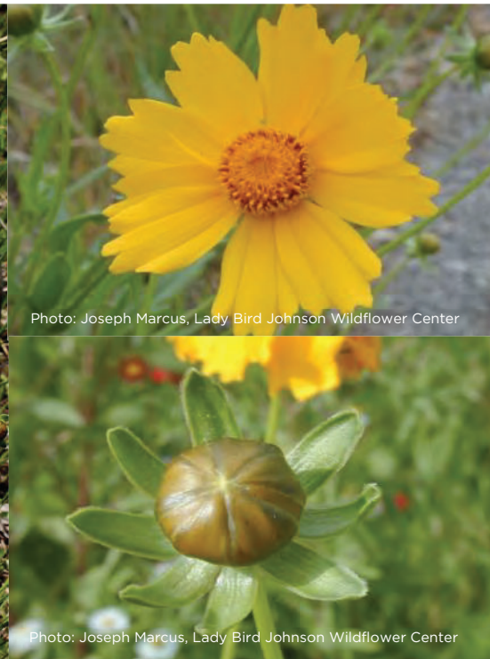
Flowering/close-up of flowers/bud