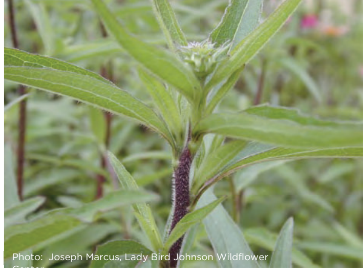
Stem and leaf